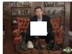
Fashion Tips for Men - Shoes