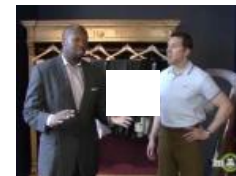
Fashion Tips for Men - Pants