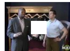
Fashion Tips for Men - Pants