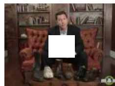
Fashion Tips for Men - Shoes